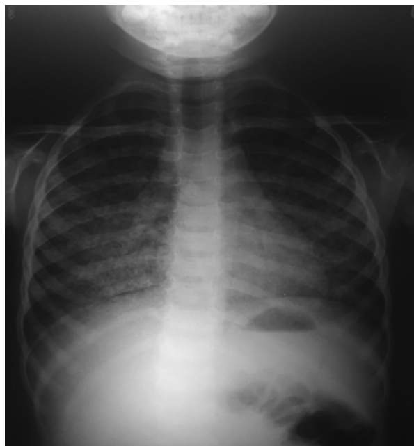
Figure 1. Chest X-ray. Front chest X-ray: micronodular infiltrate with predominant right hemithorax.

The patient remained hospitalized at the Hospital Posadas, with the following tests requested: a) tuberculin test: PPD (purified protein derivative) RT 23 (2TU): 0mm; b) gastric