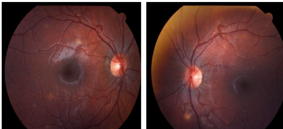
Figure 4. Retinography. Ophthalmic evolution with a reduction in number and size of tuberculous granulomas in both eyes.

It can be primary or secondary, unilateral or bilateral. It is caused by an active infection that invades the eye (with the presence of the microorganism in the ocular tissues) or by an immunological reaction of type IV retarded hypersensitivity to various antigenic components of the mycobacteria itself (in the absence of the infectious agent).