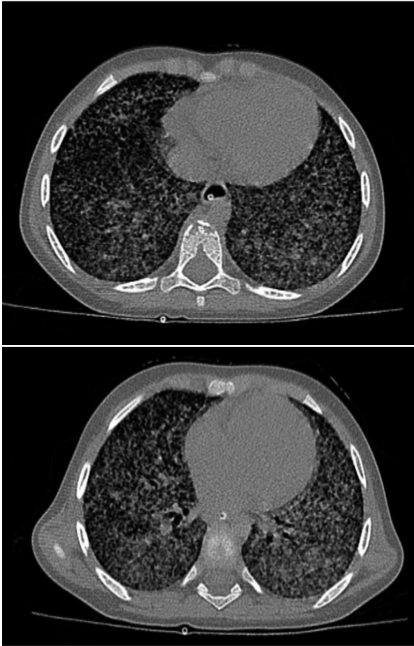
Figure 2. CHEST HRCT. Bilateral miliary pattern.

2 months of treatment: macula with normal shine. Vessels of normal caliber. Raised off-white lesions compatible with tuberculous granuloma outside both vascular arcades. ( Figure 3 )