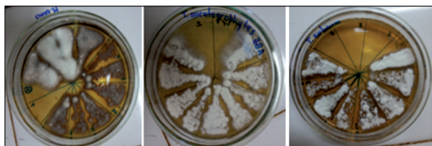
Figures 2: Replicates for MIC confirmation of EAFYM against different strains of DMT.

The MIC of the EAFYM were in a range of 31.25 to 125 mg/ml as can be seen in Table N°2.