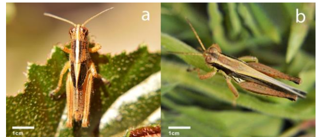
Fig. 1. Scotussa lemniscata . a. fifth-instar male. b. Adult male.

the food offered. The difference in weight between the offered rations and the remaining material after a trial represented the consumption during the test. When analyzing the results, those individuals that molted were not taken into account because during molting there is no feeding. Consumption by sex and stage of development was compared using a non-parametric Kruskal Wallis test followed by a means pair comparison between the treatments range using the statistical software InfoStat (Conover, 1999; Di Rienzo et al., 2011). Additionally, the average biomass (dry weight) of adults of both sexes was determined by individually weighting 50 males and 50 females.